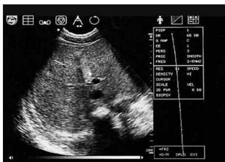
Figure 3 Abdominal ultrasound showing hyperecogenic nodules close together in the liver of the second patient.

HA are not malignant tumours, but surgical intervention may be required if sudden massive bleeding or liver failure occurs; rupture of HA with haemoperitoneum can be a life threatening complication. 8-11 HA are hypervascular tumours containing multiple sinusoids of capillaries with thin walls in which the pressure is exclusively arterial. The connective tissue support is poor and, therefore, bleeding tends to spread diffusely throughout the entire tumour. 10 A non-surgical approach should be considered for androgen induced HA, given that some tumours have regressed after AAS administration was stopped. 4-7-9-12